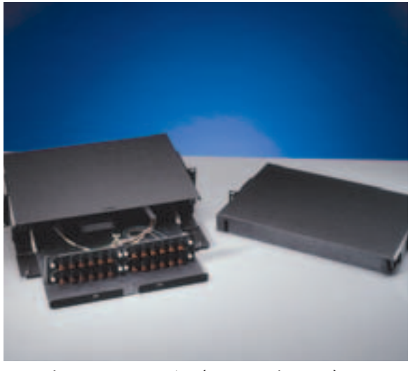
Closet Connector Housings (CCH-02U and CCH-01U) | Photo CPC71